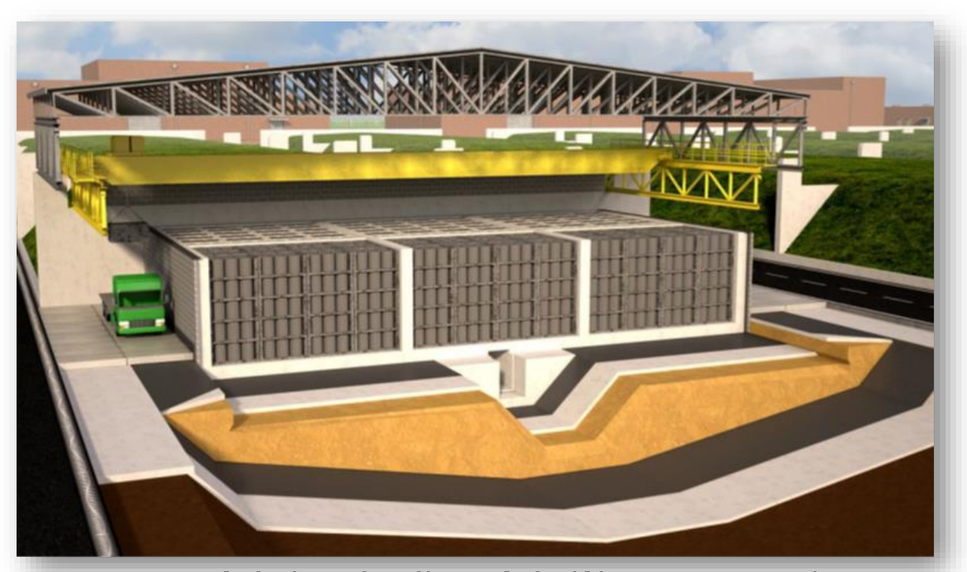
Conceptual design of a disposal facility - cross-section