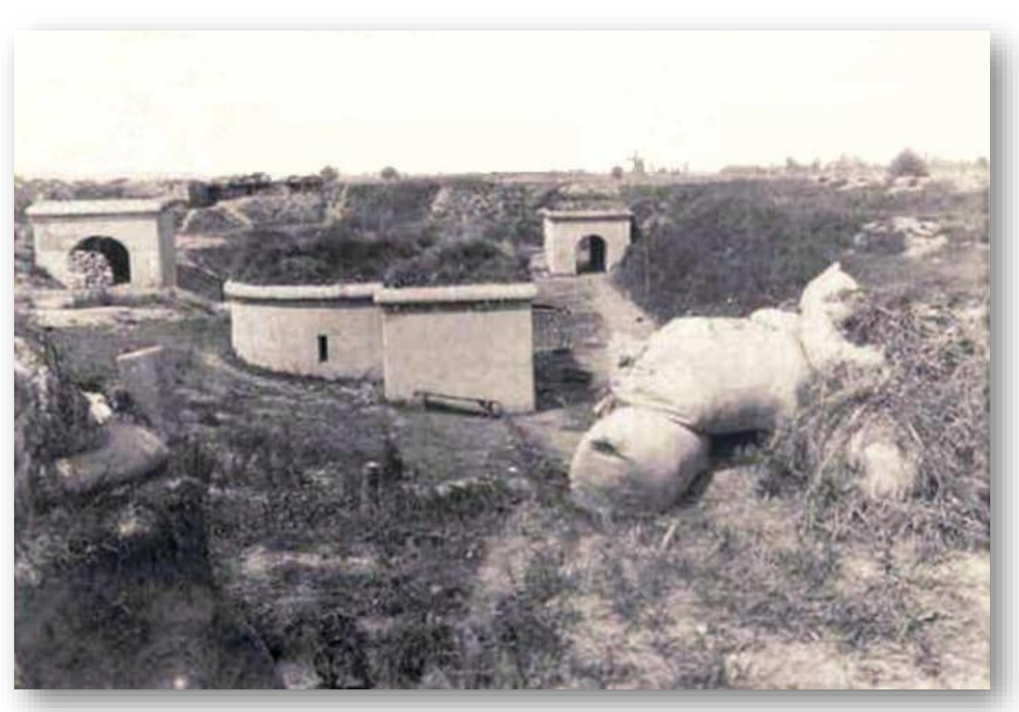
Różan Fort no. III was adapted for the facility